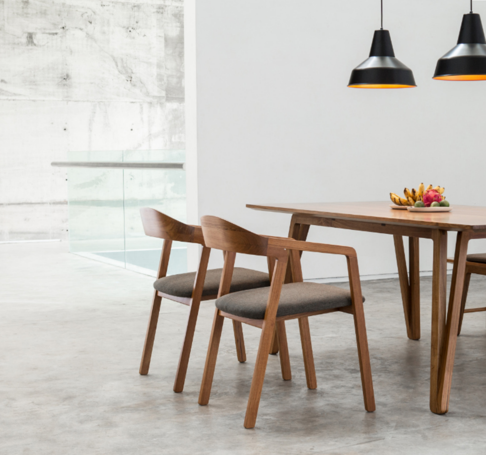
NONG dining chair, KRONG dining table and ANG bench - in plantation teak and PU-finishing. vases by @galuhanndt.