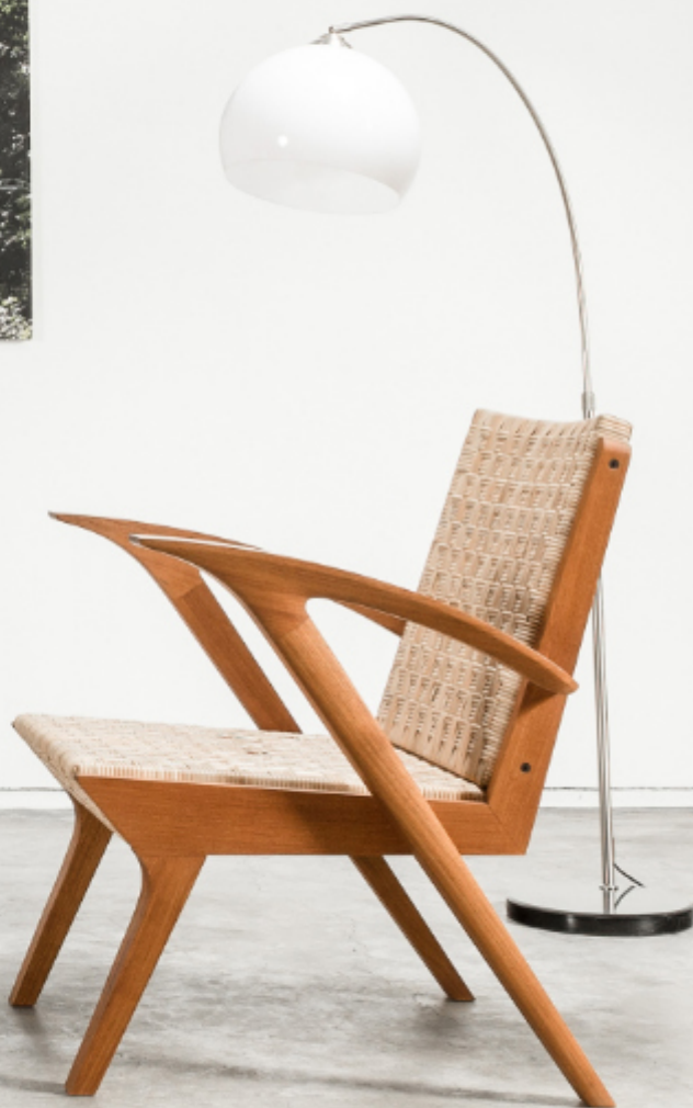
SEDAN relax chair, CILIK coffee table and JENGKI relax chair - in plantation teak and teak oil finishing. blanket by @svastliving and tea set by @aryajalu.