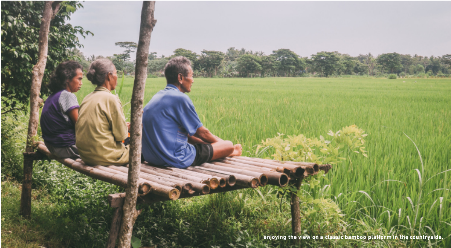
enjoying the view on a classic bamboo platform in the countryside.

the furniture's source of inspiration can be a part of daily life, local wisdom or traditional architecture depending on the aspect that the designer chose to explore and translate into his product.