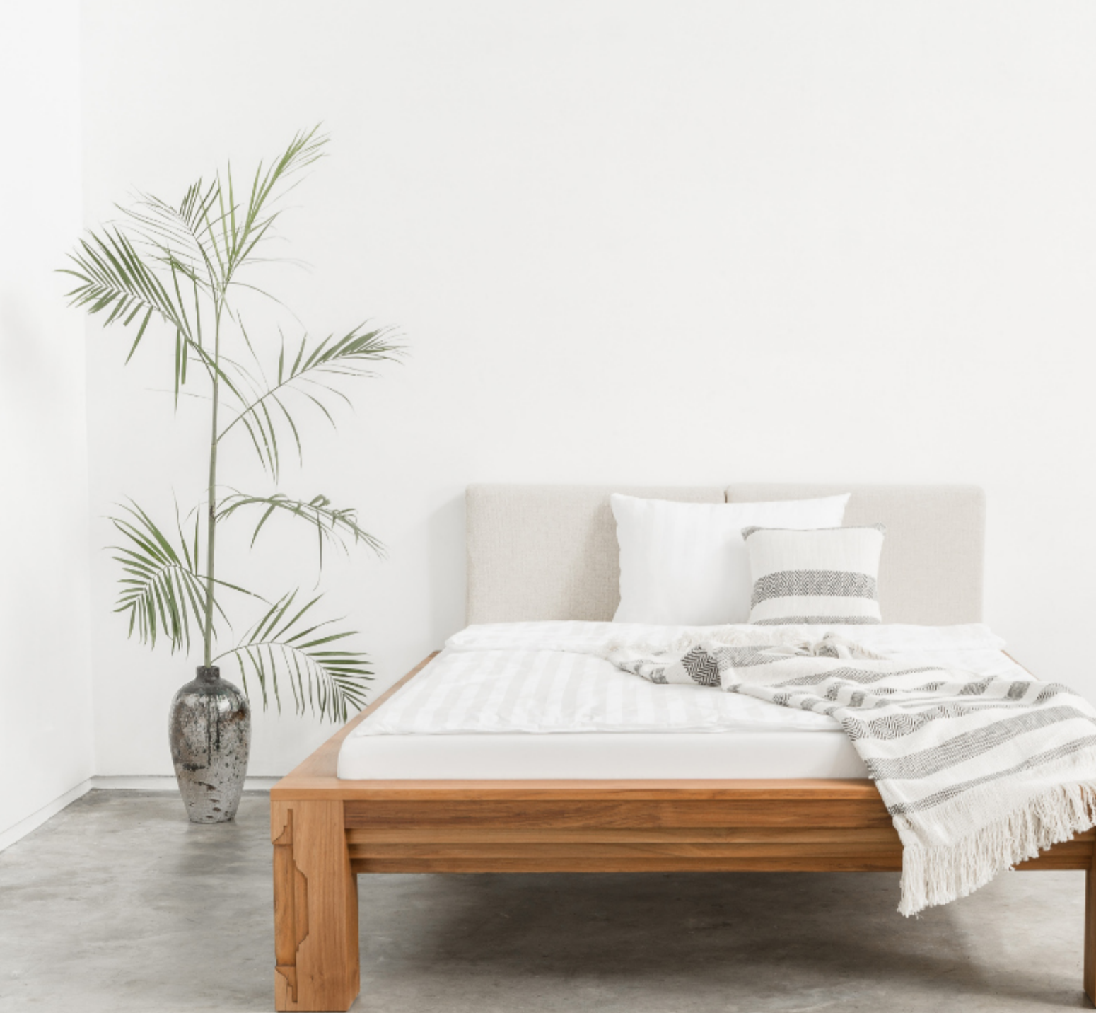
BALE bed in plantation teak, HONO wardrobe and PADI sofa table in palisander wood and stainless steel - all with teak oil finishing.