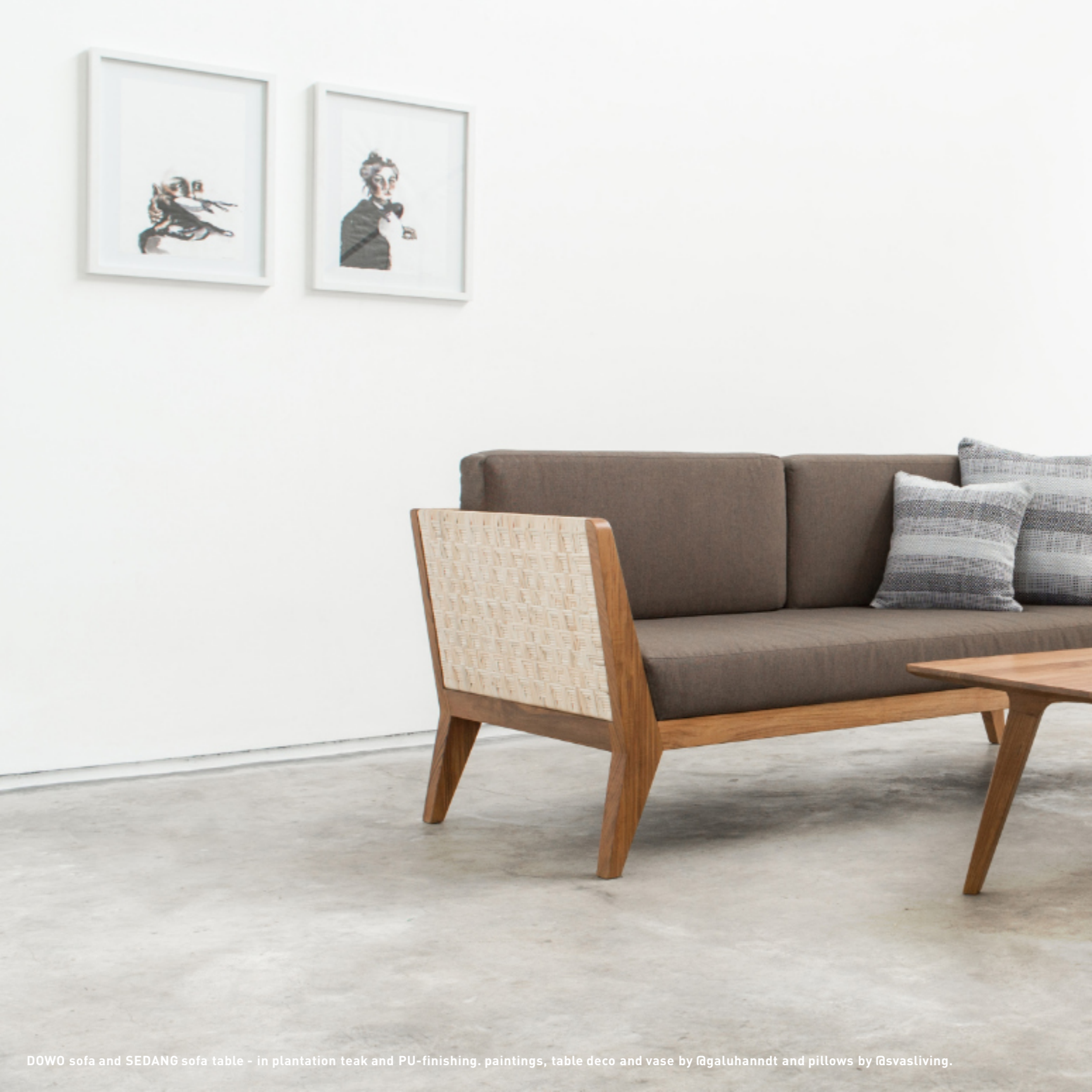
DOWO sofa and SEDANG sofa table - in plantation teak and PU-finishing. paintings, table deco and vase by @galuhanndt and pillows by @svasliving.