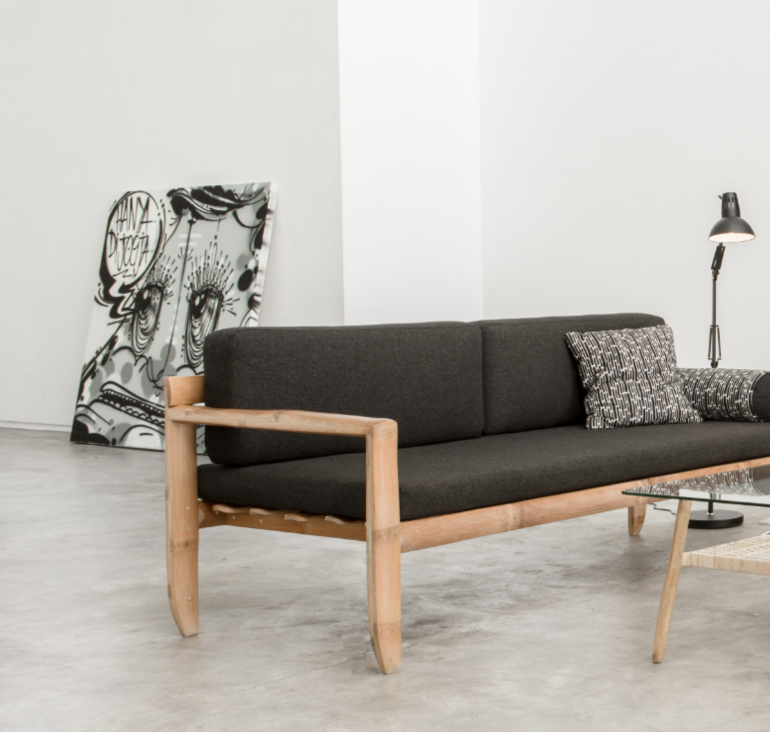
LINCAK sofa, WALANG sofa table and WENGKU stool - in bamboo and PU-finishing. graffiti art by @lovehateloveone; pillows by @populobatik and basket by @svastliving.